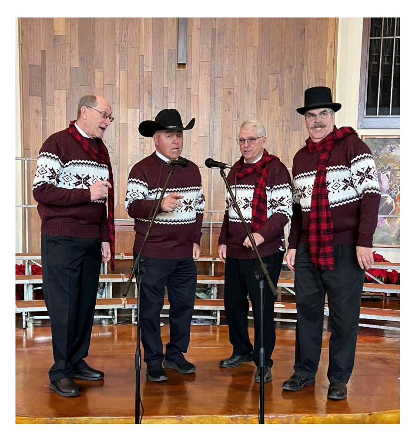
3 Lads & Alas