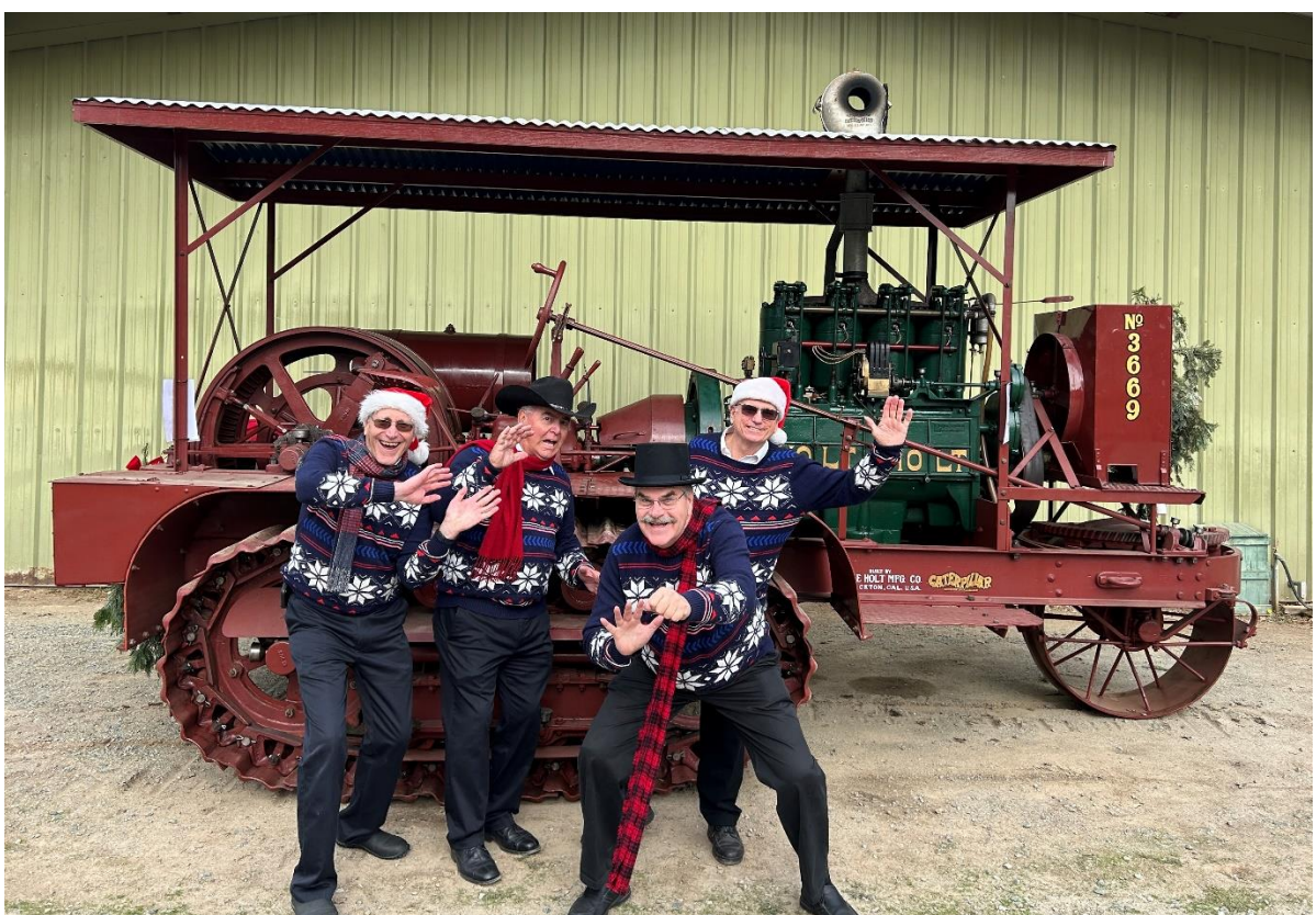
Page 14 of 27