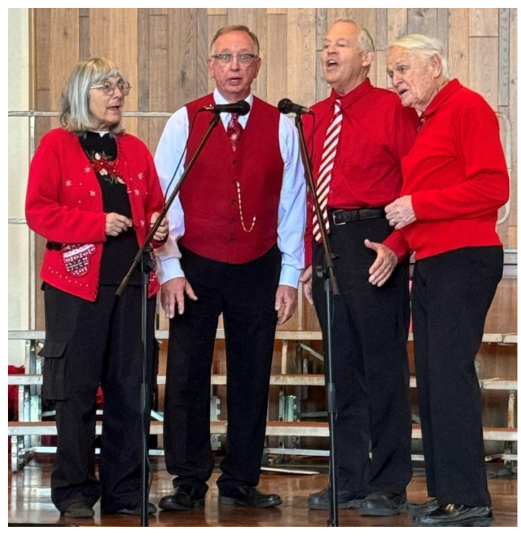
Page 20 of 27