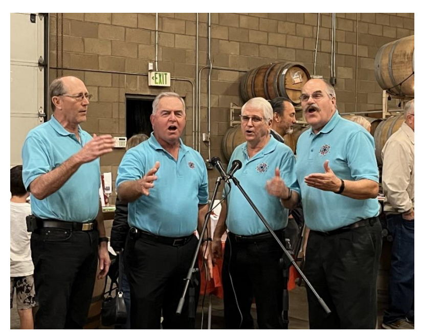
Page 11 of 27

In order to encurage support fot the Portsmen's trip to France, we shared a couple of songs at the Gala