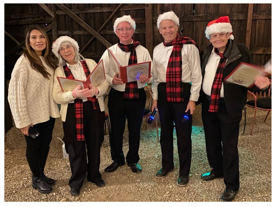
Page 9 of 27

December has been busy for Three Lads and Alas! We performed on the Portsmen Christmas show and received some compliments. We also appeared at Christmas luncheons for the Sierra Belles ladies club in Jackson and the PEO ladies club in Lodi and enjoyed them very much. Our most gratifying performance was at the Ione Business Association opening of the Christmas season. We were able to carol up and down the commercial section of Main Street (all two blocks of it) and got a very positive reaction. The first week of January, we'll be back at work preparing for the Novice Contest, Singing Valentines, division competition, the Portsmen spring show, and then—for 3/4ths of us—on to Normandy!