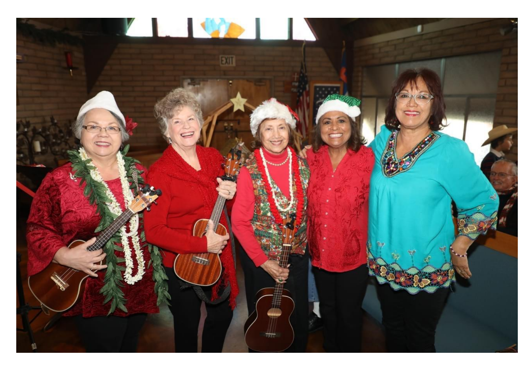
Hot Mess Express