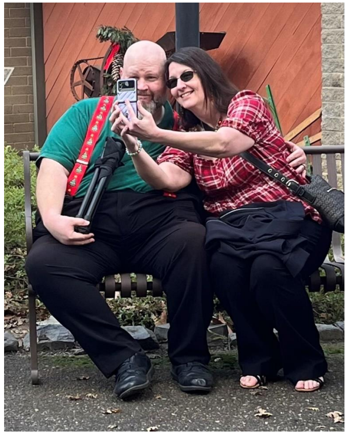
Page 15 of 27