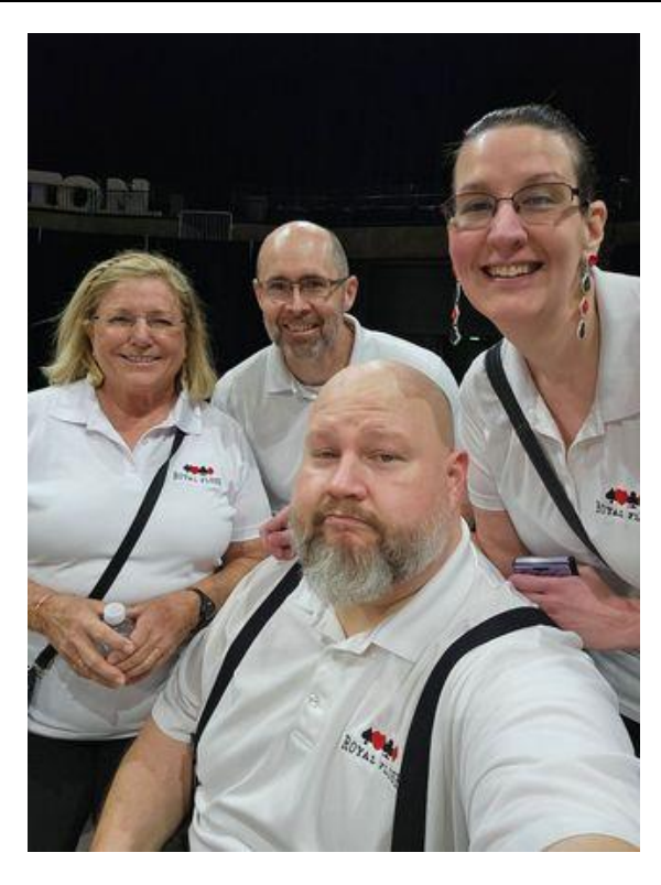
Page 19 of 22