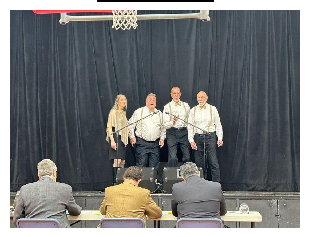
Three Lads & ALAS