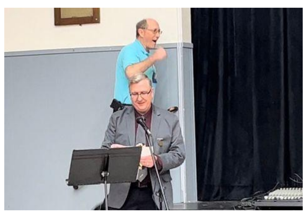
Page 16 of 22