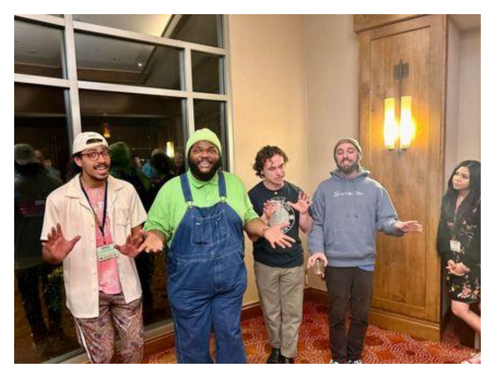
Page 8 of 22