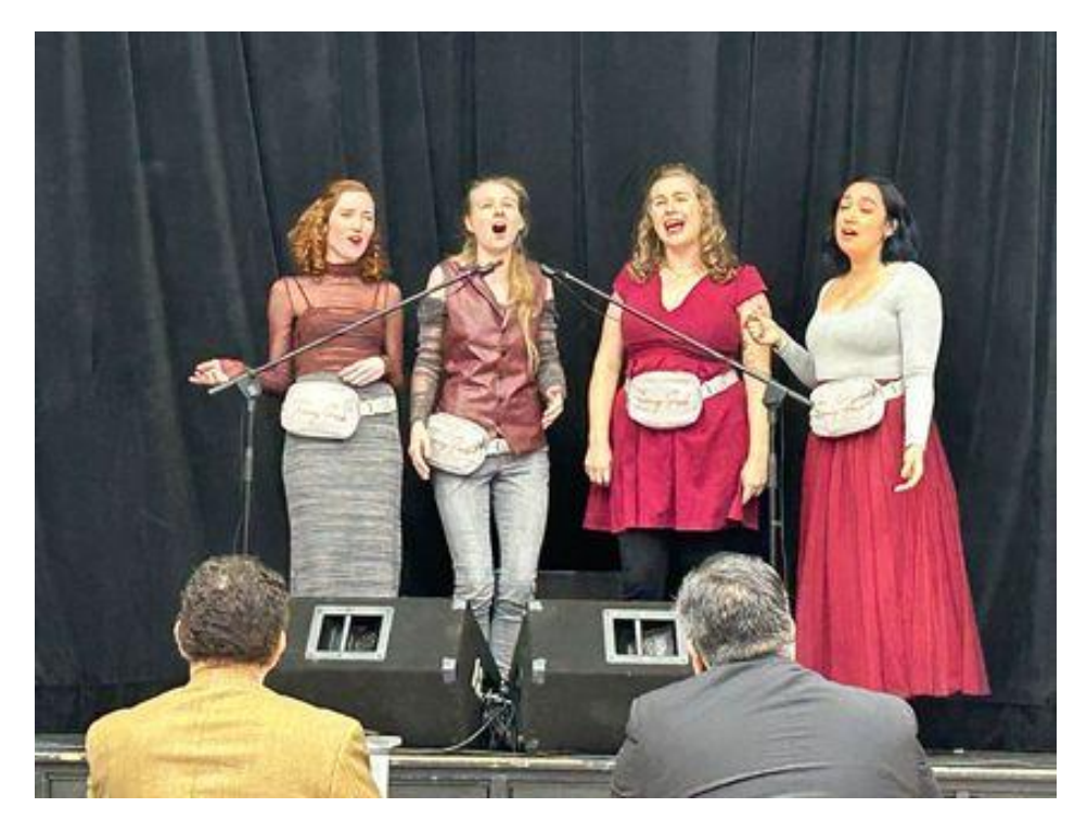
Snag a Bass